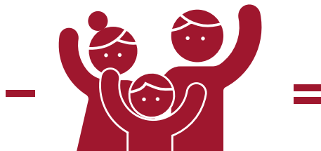
STUDENT AID INDEX (SAI)