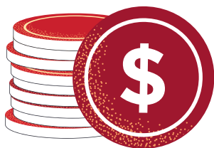
COST OF ATTENDANCE (COA)

Formula change will mean more Pell Grants for some students