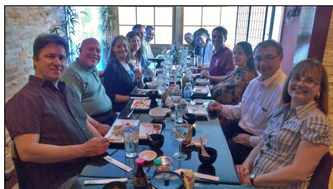
The Department enjoyed a nice end-of-year dinner at their favorite sushi bar, Umi Grill.